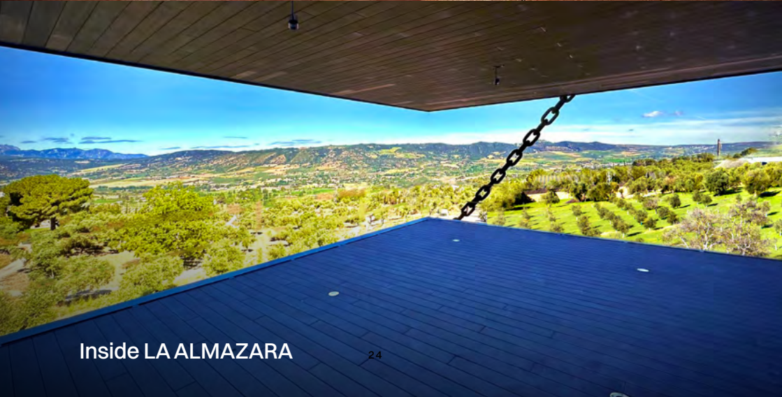
Inside LA ALMAZARA